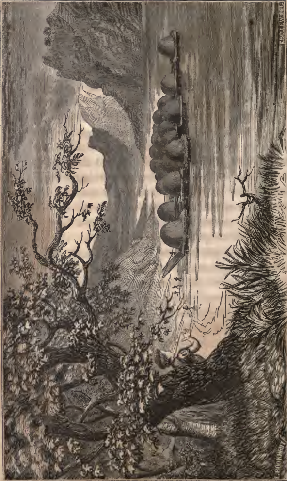
We landed in a port where we found a village built over the water like Venice. The houses were shaped like bells, built upon very large piles, having entrances by means of drawbridges. (SEE PAGE 126.)